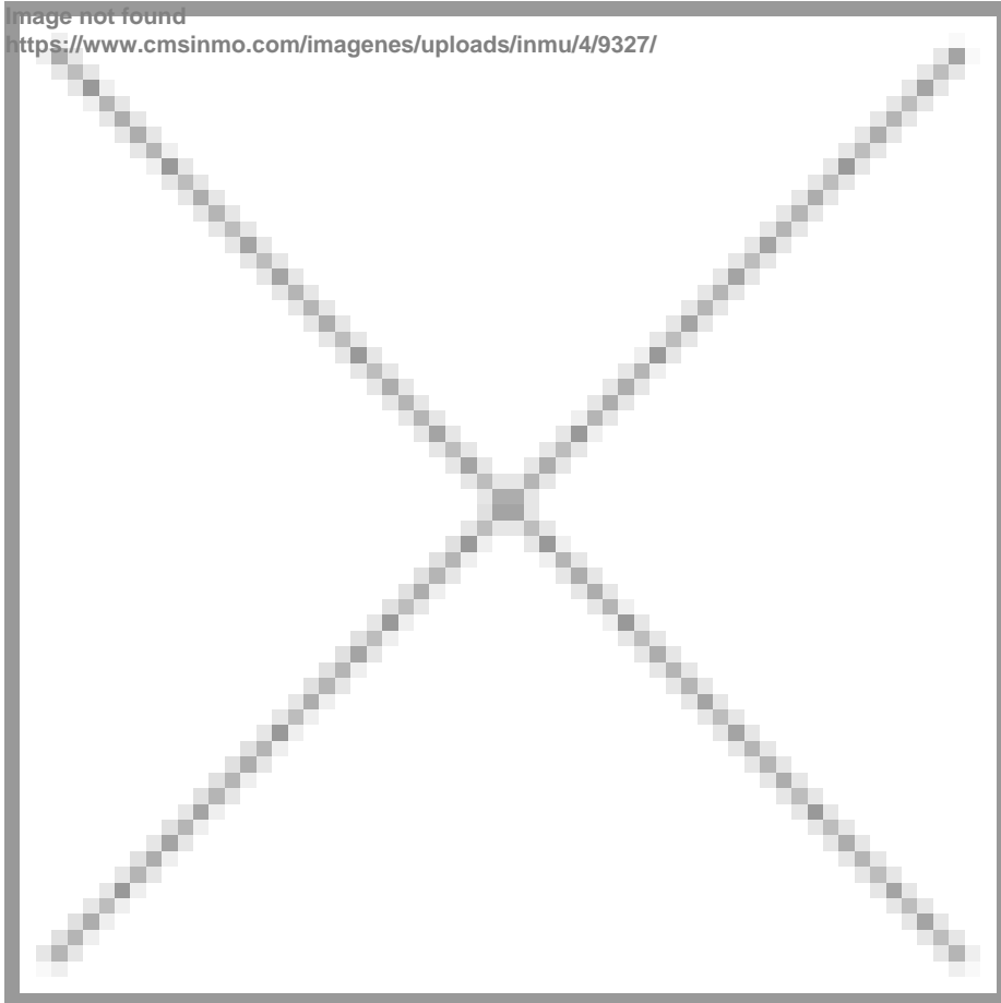
Image not found https://www.cmsinmo.com/imagenes/uploads/inmu/4/9327/