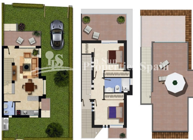
Imagen Artística carece de valor contractual/Artistic Image free of contractual nature

Model: Samara Corner Property: 99,6m 2 Garden: 90-120m 2 Roof-Terrace: 30m 2 2 Bedrooms 2 Bathrooms