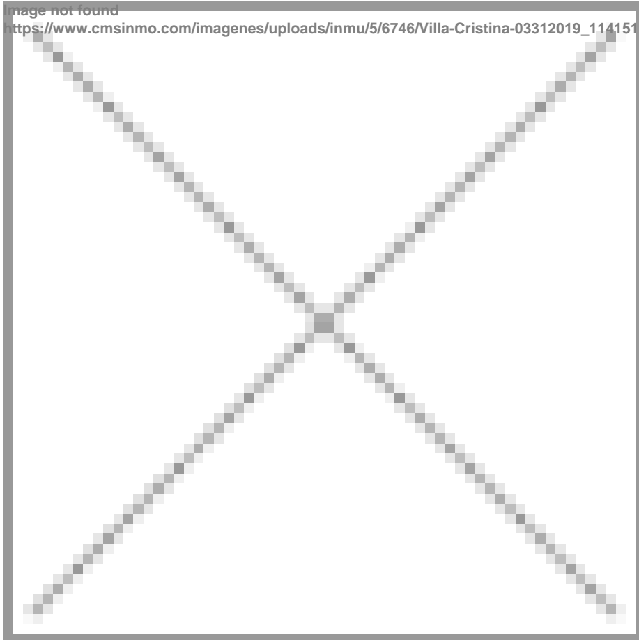
image not found https://www.cmsinmo.com/imagenes/uploads/inmu/5/6746/Villa-Cristina-03312019_114151.jpg