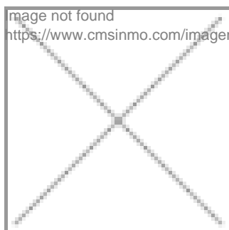
image not found https://www.cmsinmo.com/imagenes/uploads/inmu/5/4427/Sax_villa_300m2_3750m2_plot_(7).JPG