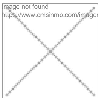
image not found https://www.cmsinmo.com/imagenes/uploads/inmu/5/4427/Sax_villa_300m2_3750m2_plot_(7).JPG