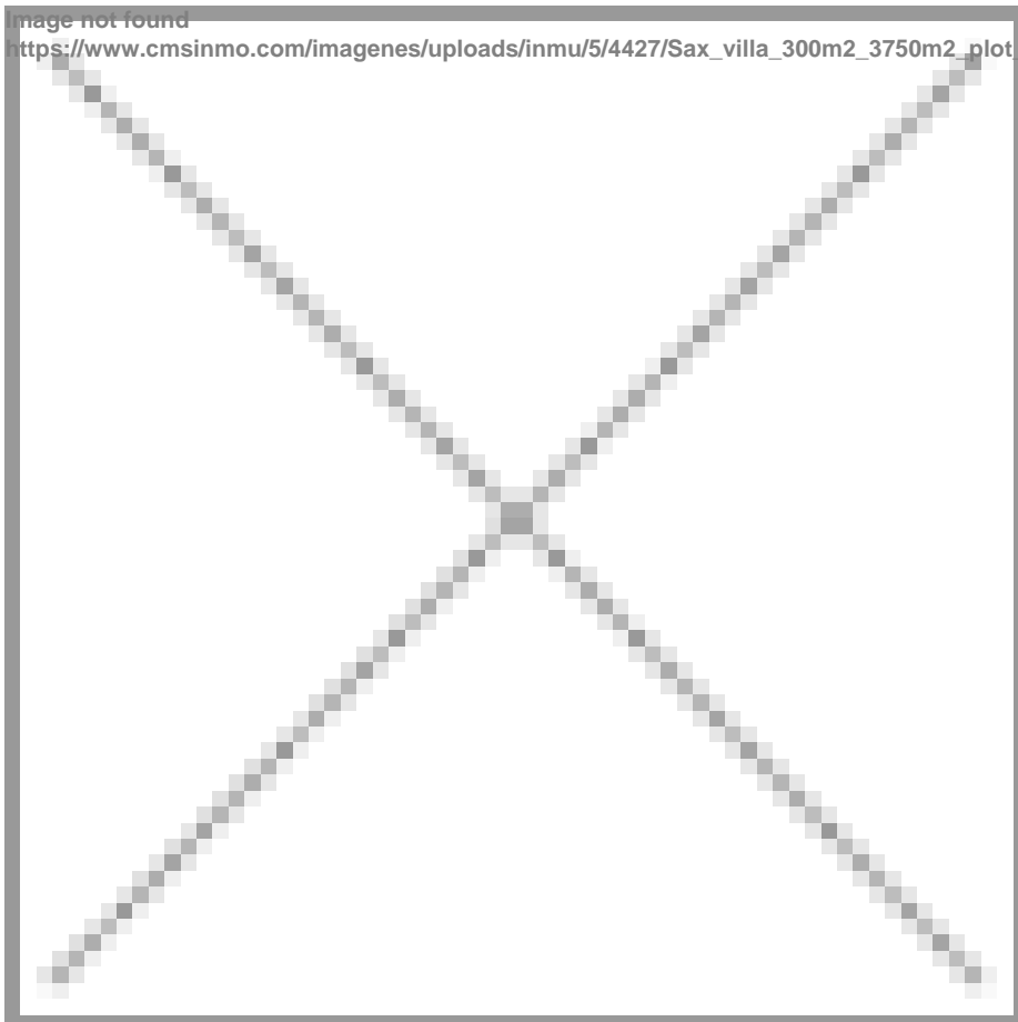
image not found https://www.cmsinmo.com/imagenes/uploads/inmu/5/4427/Sax_villa_300m2_3750m2_plot_(7).JPG