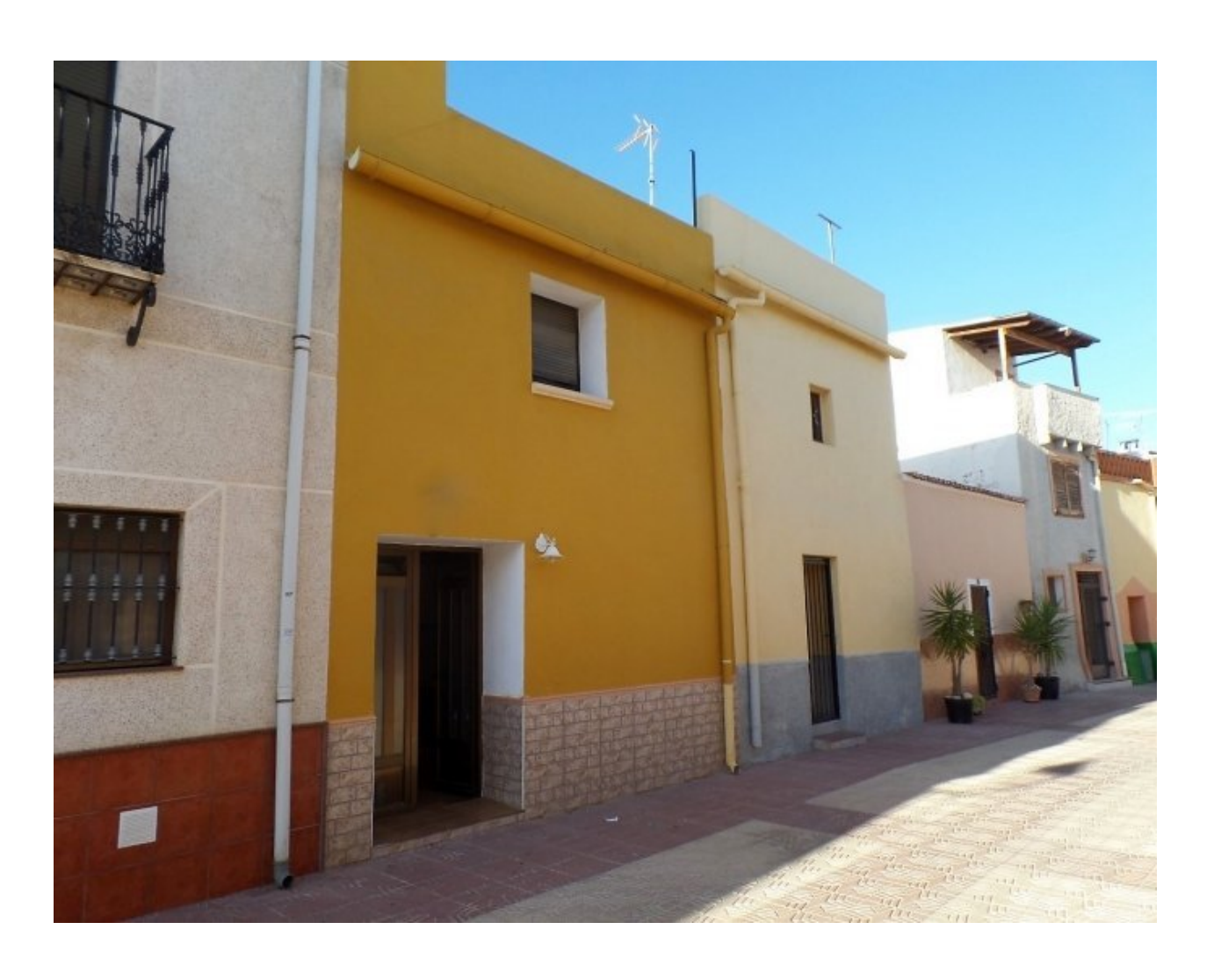
"OUR EXPERIENCE IS YOUR GUARANTEE"