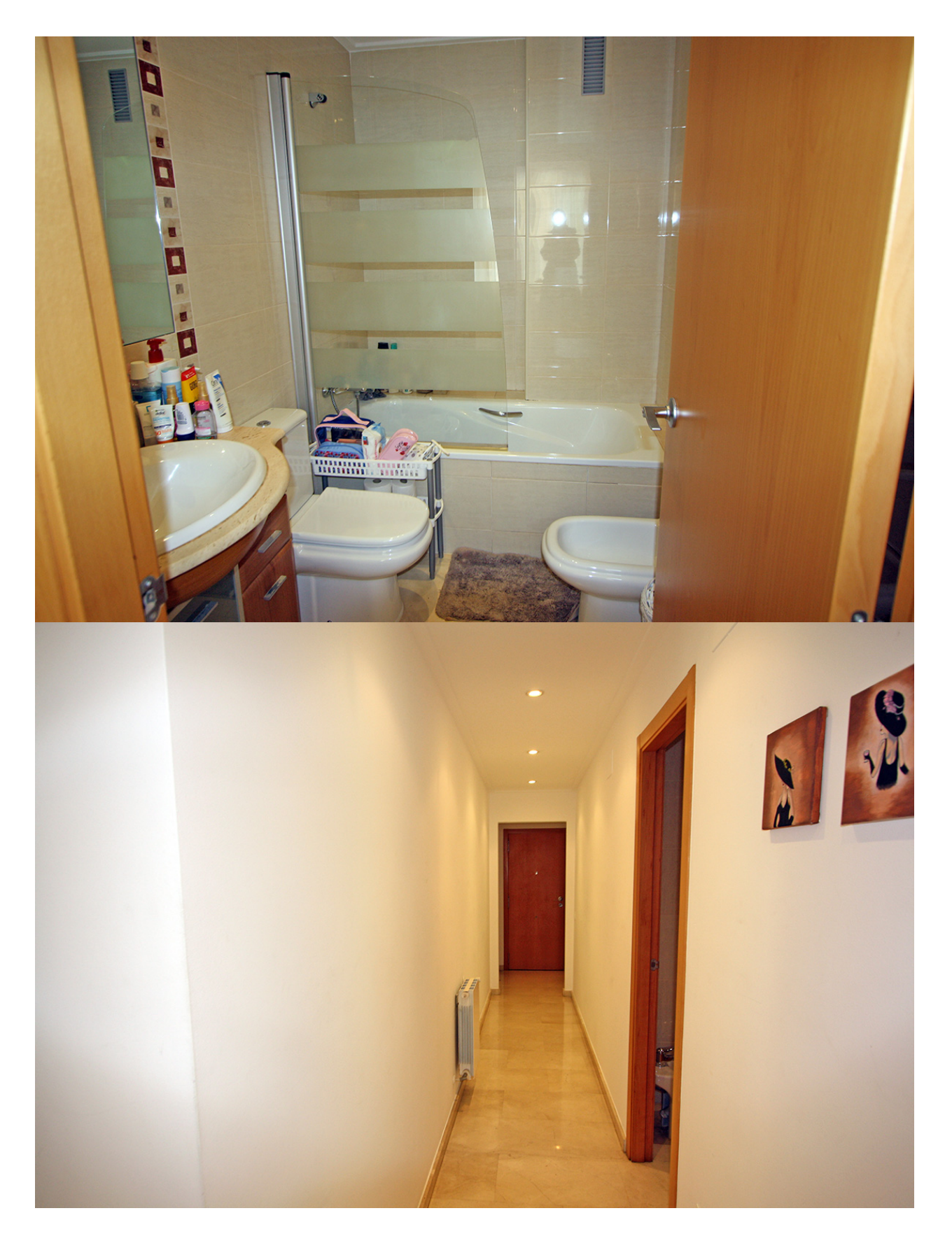
"OUR EXPERIENCE IS YOUR GUARANTEE"